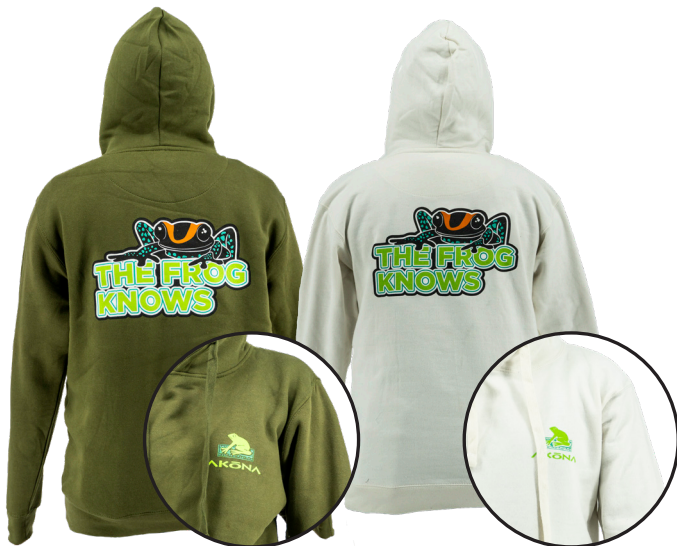
AKHOODIE-MG-XX Mill Green Hoodie