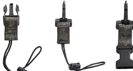
AKC-05 AKC-06 AKC-07