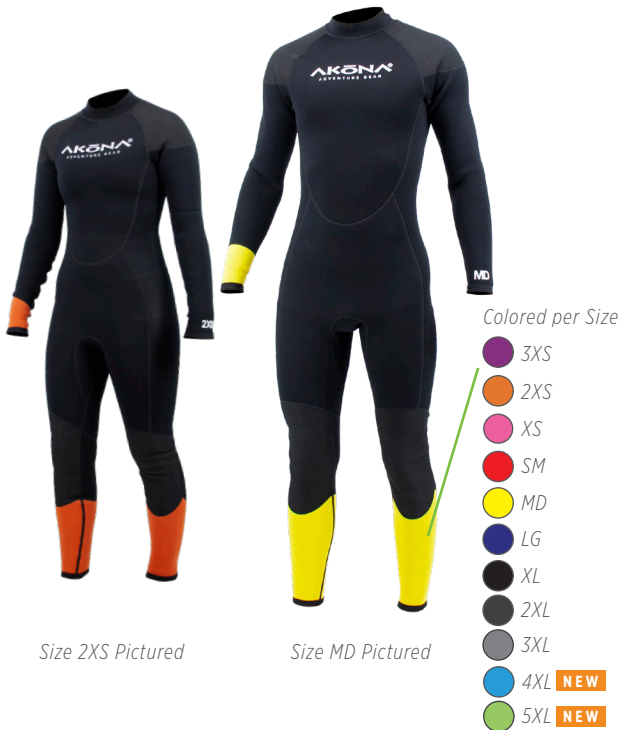
Size 2XS Pictured