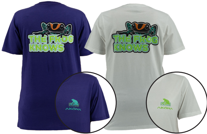
AKFROG-SS-PR-XX Purple T-Shirt