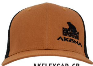
AKFLEXCAP-CB Flexfit Trucker Hat