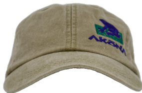
AKDADCAP-OL Dad Cap