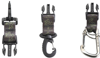
AKC-02 AKC-03 AKC-04

Standard, Deluxe and Stainless Steel Gauge clips