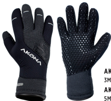
AKNG430 3MM AKNG450 5MM