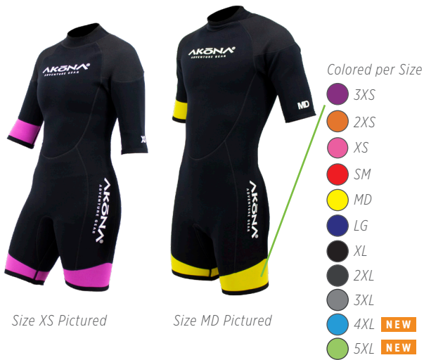
Size XS Pictured